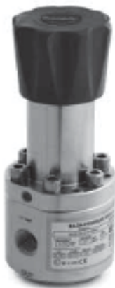
BS6 Series Regulator