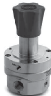
LRS4 series Regulator