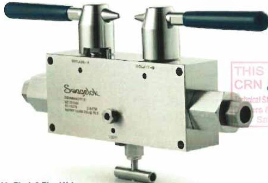
Double Block & Bleed Valves

THIS IS PART OF CRN 0C18171.5 Technical Standards & Safety Authority Pressure & Pressure Vessels Safety Program