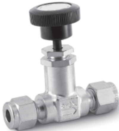
JN Series Valve