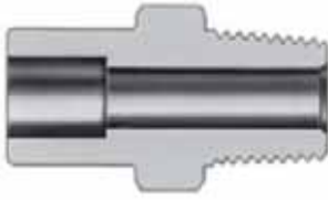
Tube socket weld to male NPT connector