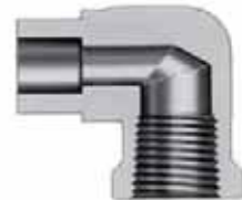
Tube socket weld to female NPT elbow