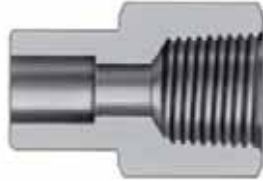
Tube socket weld to female NPT connector