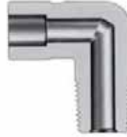
Tube socket weld to male NPT elbow